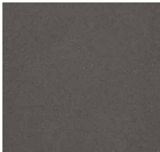
GRAPHITE Only available in Cap

Due to the natural materials in our products, colors may vary from those shown on the cut sheet. We recommend viewing actual product samples to ensure the perfect color and finish for each project.