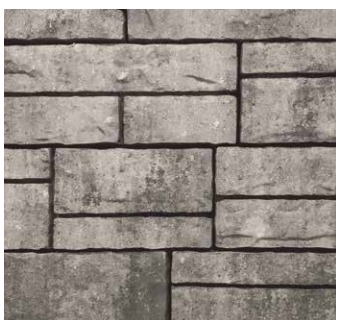
R I U Wall Cap / Column Cap not available