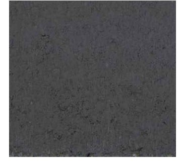
DARK CHARCOAL Wall Cap / Column Cap only. Swatch represents product color only, not dimension and/or shape